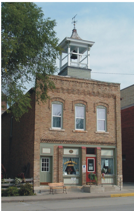
National State & Historic Place